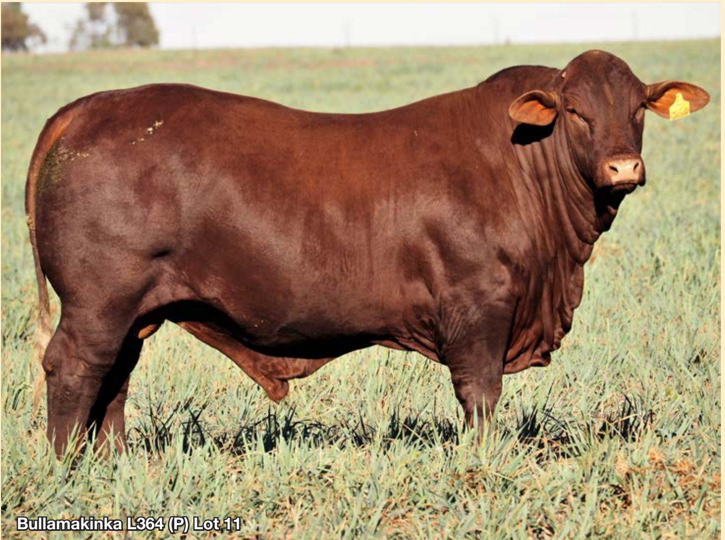
Bullamakinka L364 (P) Lot 11

A select draft of quality Bullamakinka bulls offered under the helmsman system.